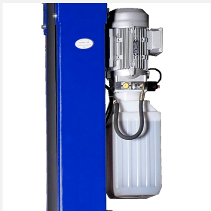
Quality hydraulic pump