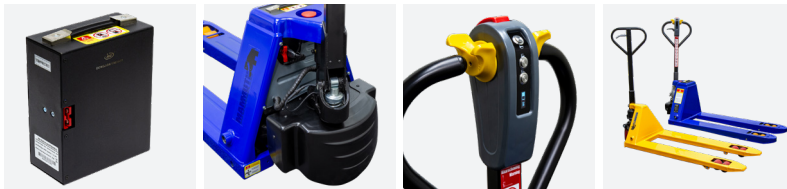
Removable lithium-ion battery