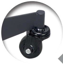
Glass fiber and nylon wheels