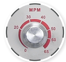
Infinitely adjustable speed