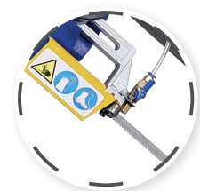
Saw blade guide